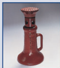
Bell Bottom Jacks 12 & 20 Ton Models