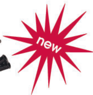
Cable Reel Jacks 516MCR