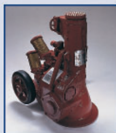
Air Motor Jacks 20 to 100 Ton Models