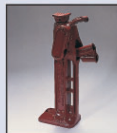
Ratchet Jacks 5 to 20 Ton Models