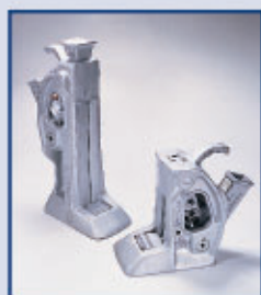
Track Jacks 7.5 & 15 Ton Models